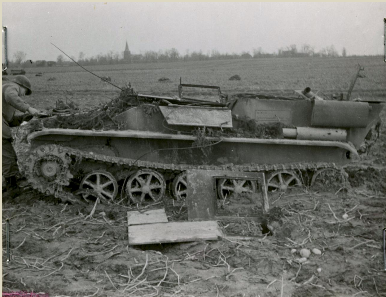
Photo 3. Left side view.