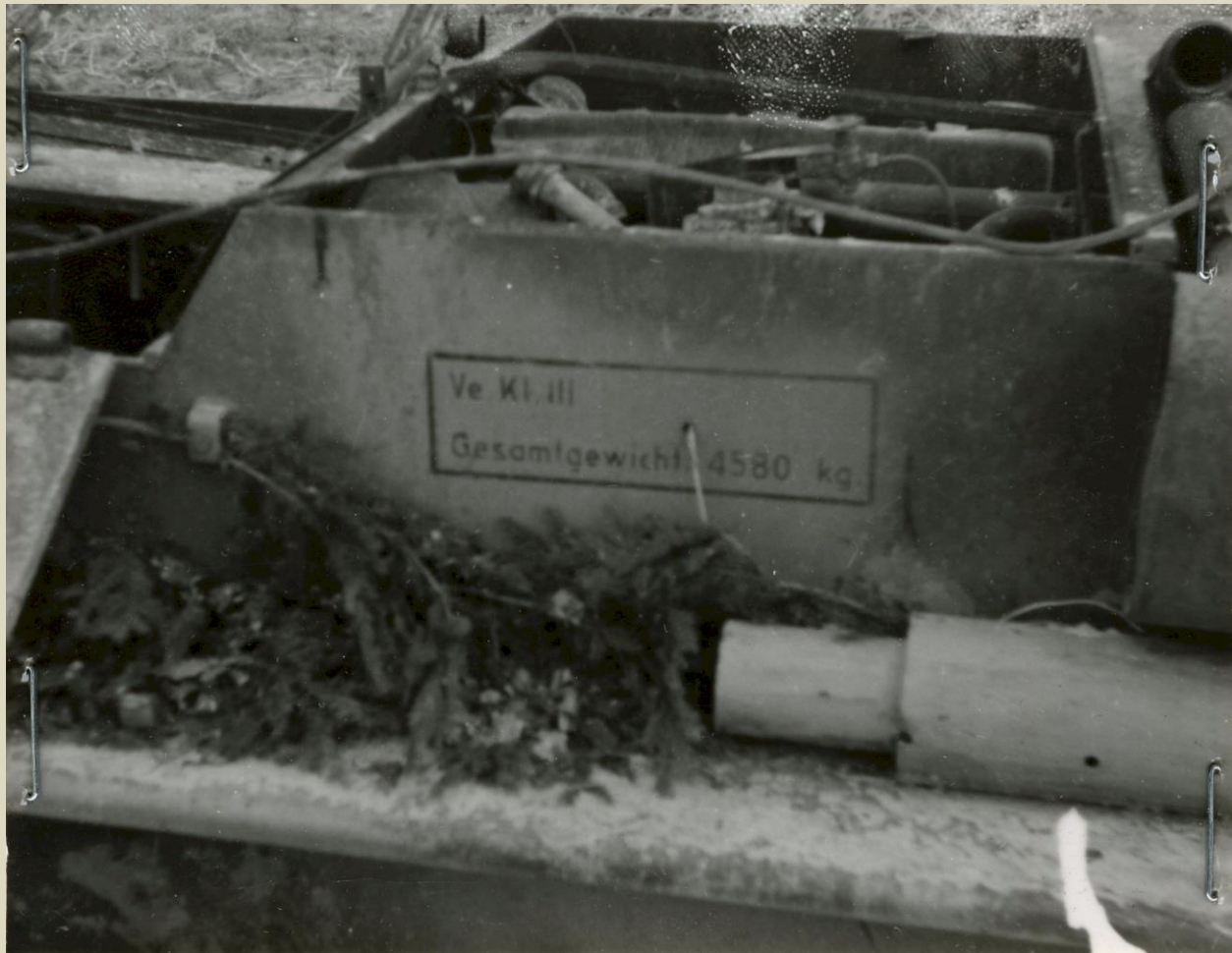
Photo 6. Markings on Left side.