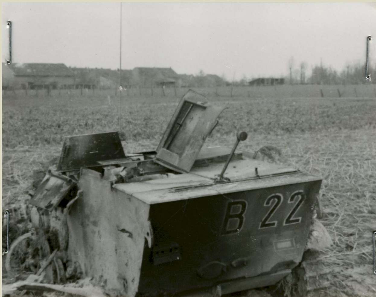
Photo 5. Rear of blown-up vehicle.