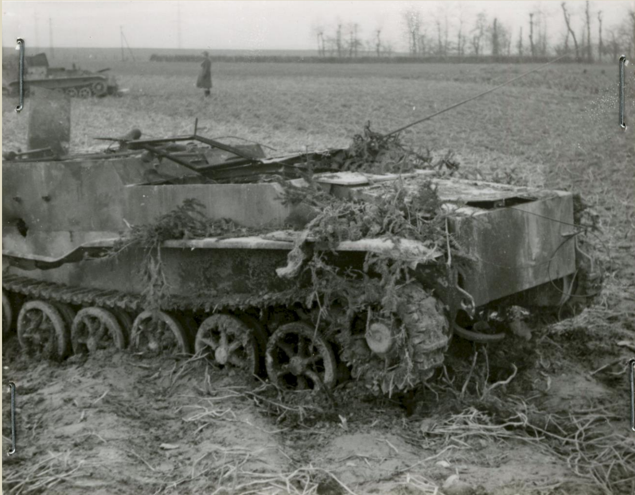
Photo 2. Right side. Note hit one side of engine compartment.