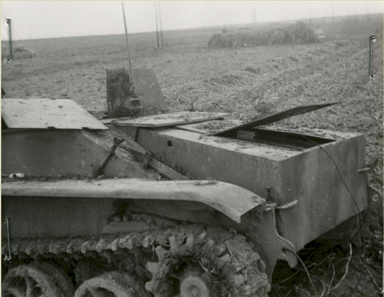
Photo 4. Explosive charge.